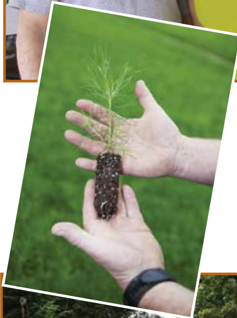
MIDDLE: Nearly 4,000 of these tiny seedlings, also known as "plugs" were distributed by the NFA throughout 2012 at community events in town.