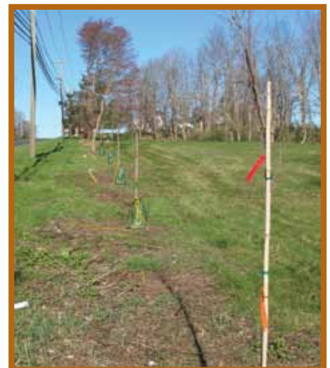
Princeton Elms at the Blackman Preserve

Several young Princeton Elms were planted earlier this year at the NFA's Blackman Preserve along Mt. Pleasant Road at Blackman Road. This native tree was once very common in Connecticut, but many were wiped out in the 1930s by a devastating outbreak of Dutch Elm disease. The "Princeton" variety of the American Elm is more disease resistant. The NFA would like to thank the Newtown Lions Club in helping to secure and plant these trees.